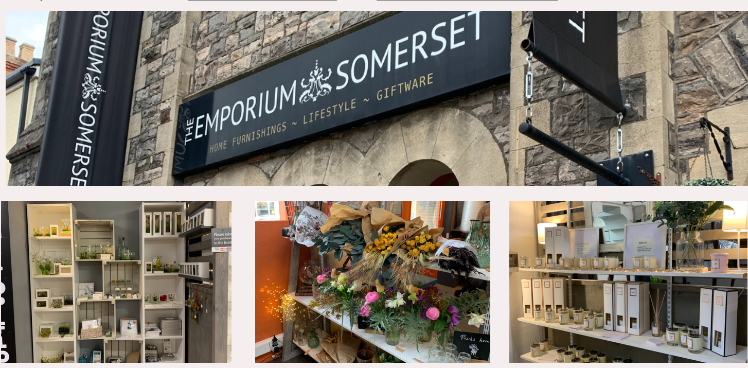
Sally Kent Glass

<u>The Emporium</u> Somerset is an award-winning store in the very heart of Wellington. home to over 65+ different shops offering thousands of homeware and gift items, many of which are handcrafted in the surrounding areas by talented traders. It's owned and run by Cato Cooper who also sells <u>Nkuku accessories</u> and <u>Autentico Chalk Paint</u>.