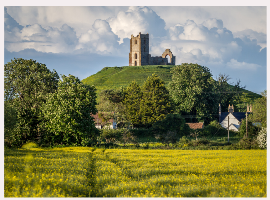
Burrow Mump, by Craig Stone

There are many <u>National Trust</u> locations in Somerset, who truly offer something for everyone.