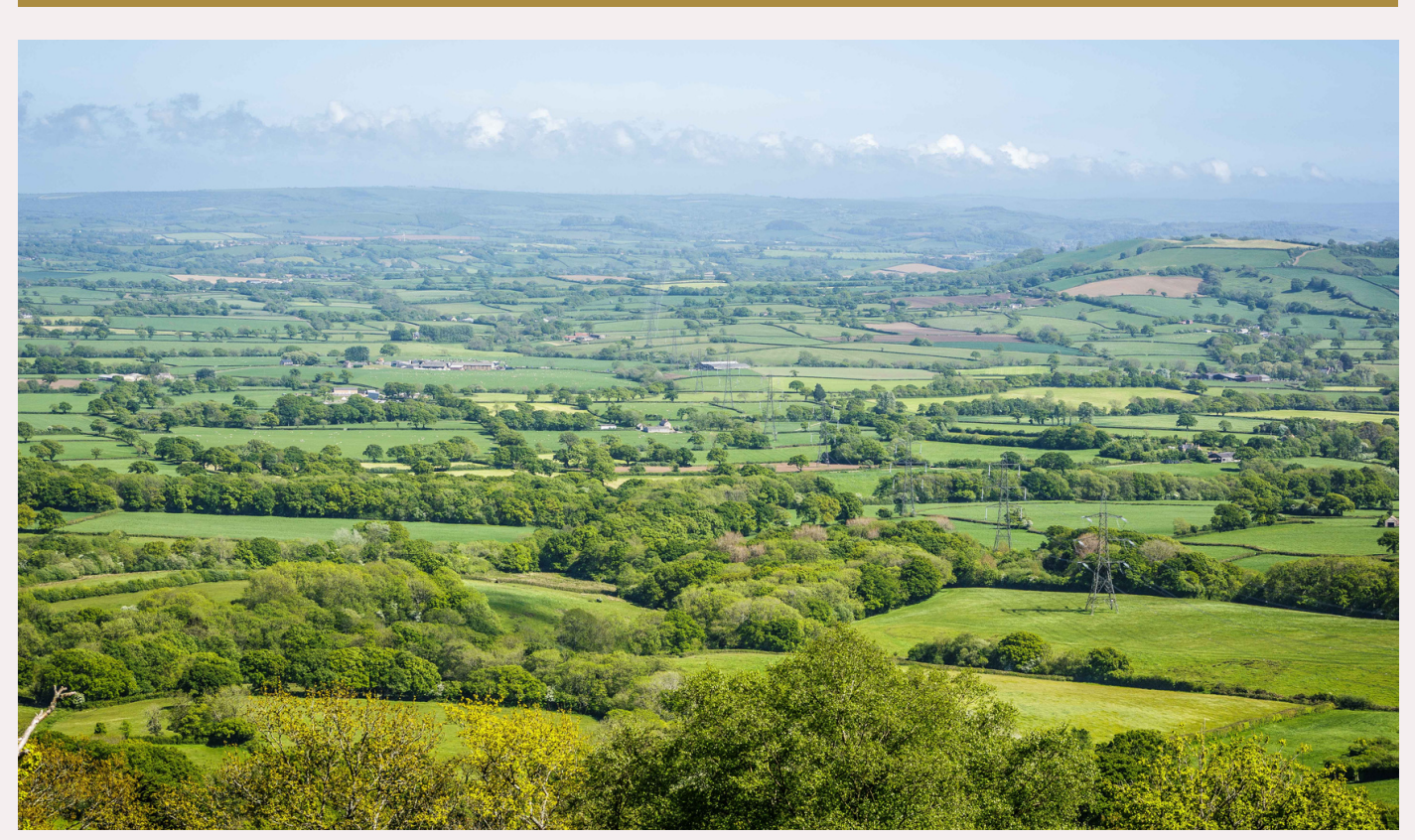
Somerset countryside, by Craig Stone