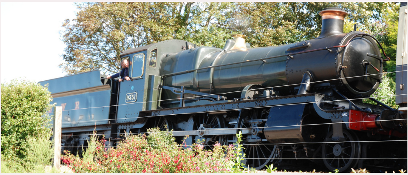
West Somerset Railway